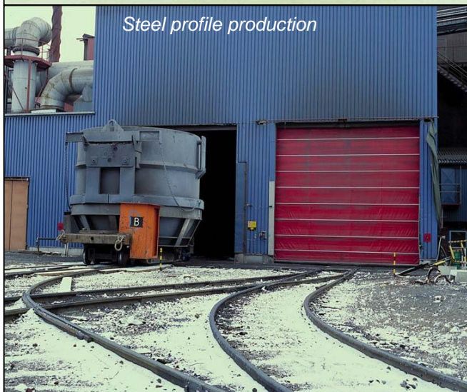
Steel profile production