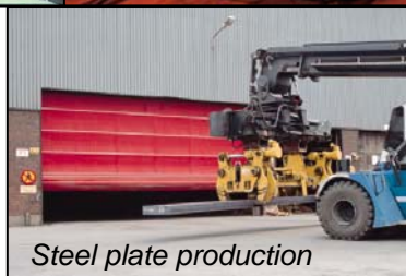
Steel plate production

Megadoors have been installed at plants throughout Europe and have proven extremely successful thanks to the extraordinary durability and reliability.