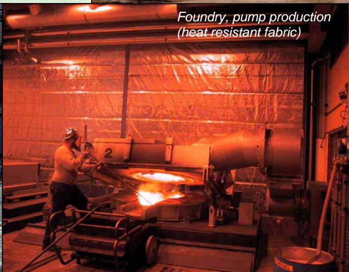
Foundry, pump production (heat resistant fabric)