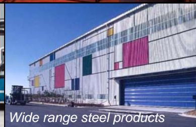
Wide range steel products