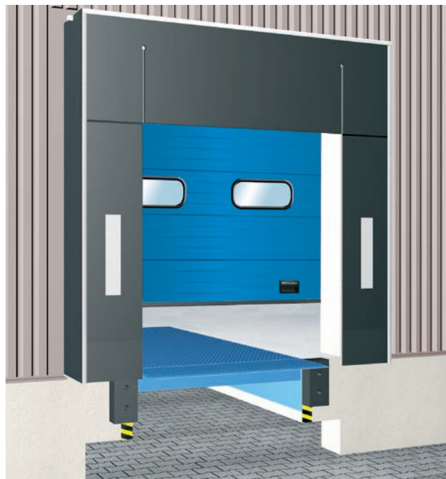
Loading bay with the Crawford 620 teledock.

The Crawford 620 teledock is easy to install. A number of frame alternatives facilitate installation in new or existing loading bays.