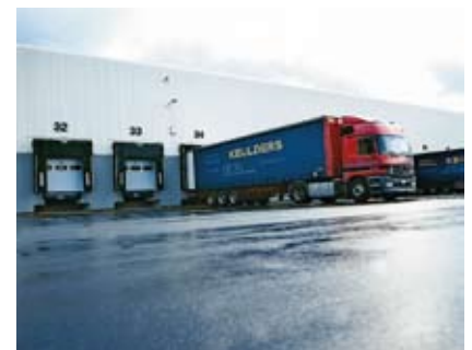
For a wide range of vehicle sizes.