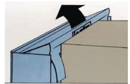
Self-adjusting roof frame.