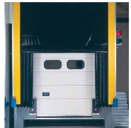
For high and low lorries.