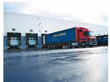
For a wide range of vehicle sizes.