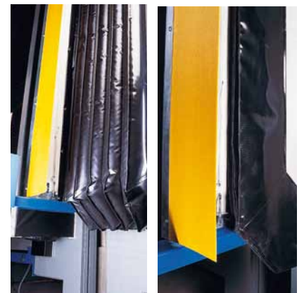
Activated position. Resting position.